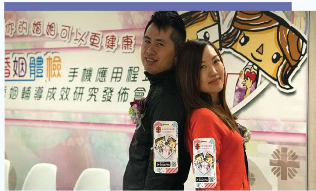
• Put core values of marriage into action

Caritas Family Service had launched the first “Mobile Application for Marriage Check-up” in Hong Kong, both for iPhone and Android users on 4 February 2018. It aimed at providing user-friendly and trendy ICT platform for self-administrated check up on marital relationship, online registration for marriage enrichment programmes, database of articles, bookmarks, videos and community resources for married couples.