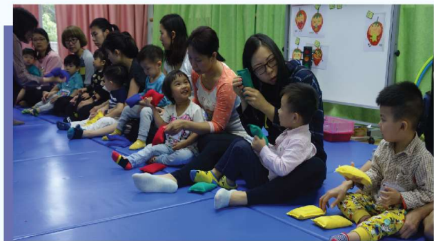
• Parents nurture kid's positive character through parent-child interaction