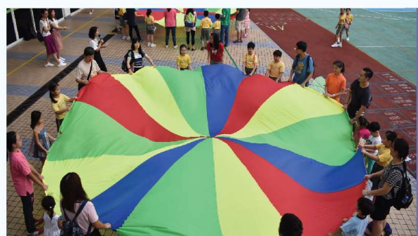
• The parents and their children were playing happily in the Fun Day