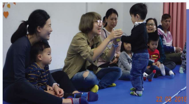
• Kid served his mother as action of love